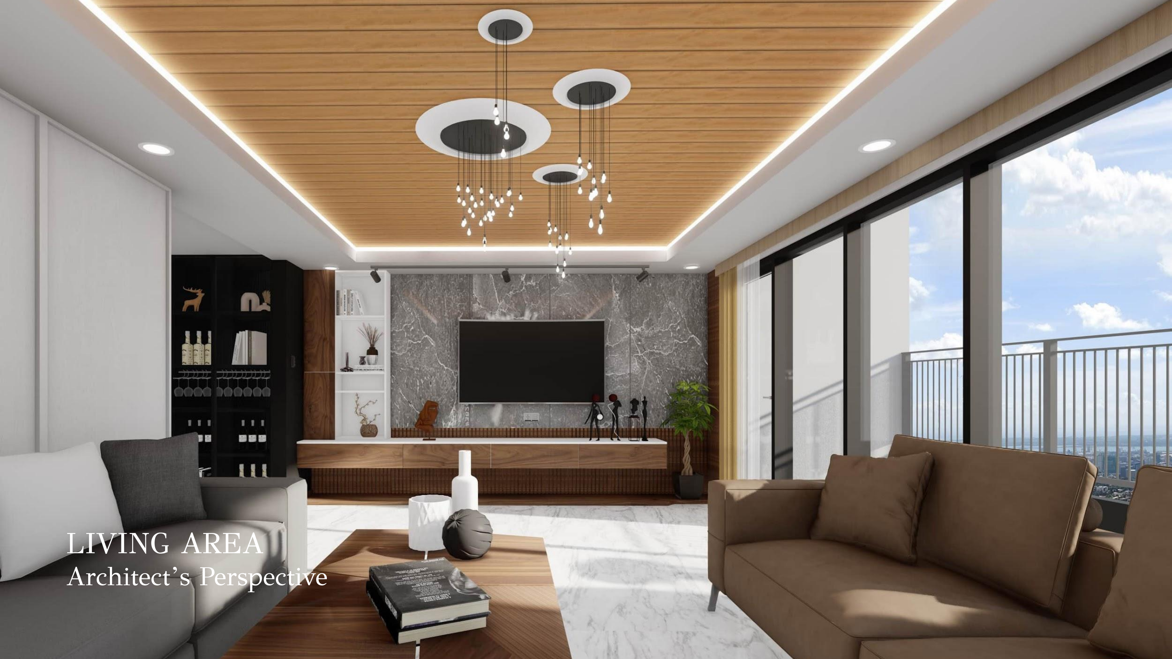
LIVING AREA Architect's Perspective