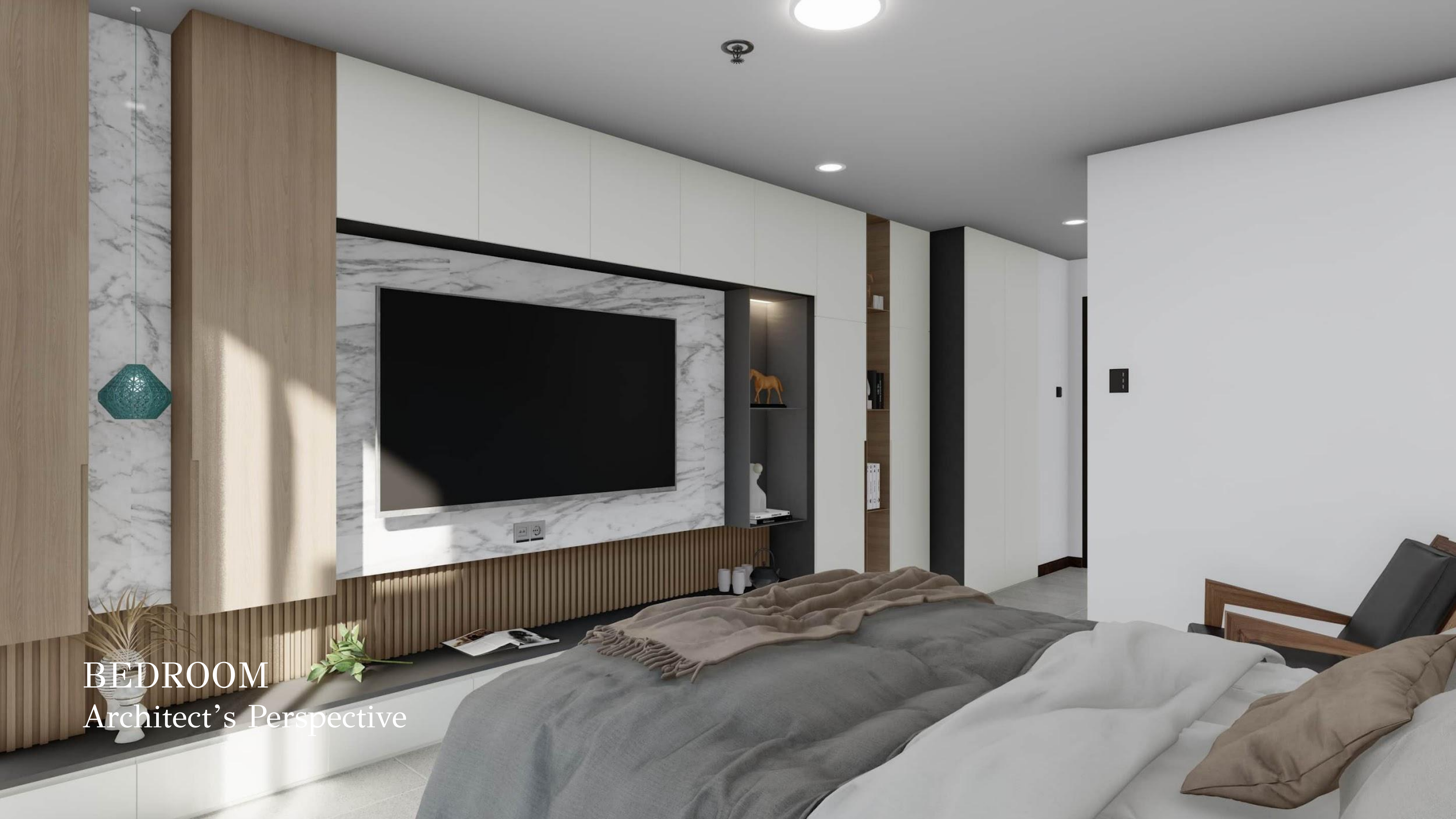
BEDROOM Architect's Perspective