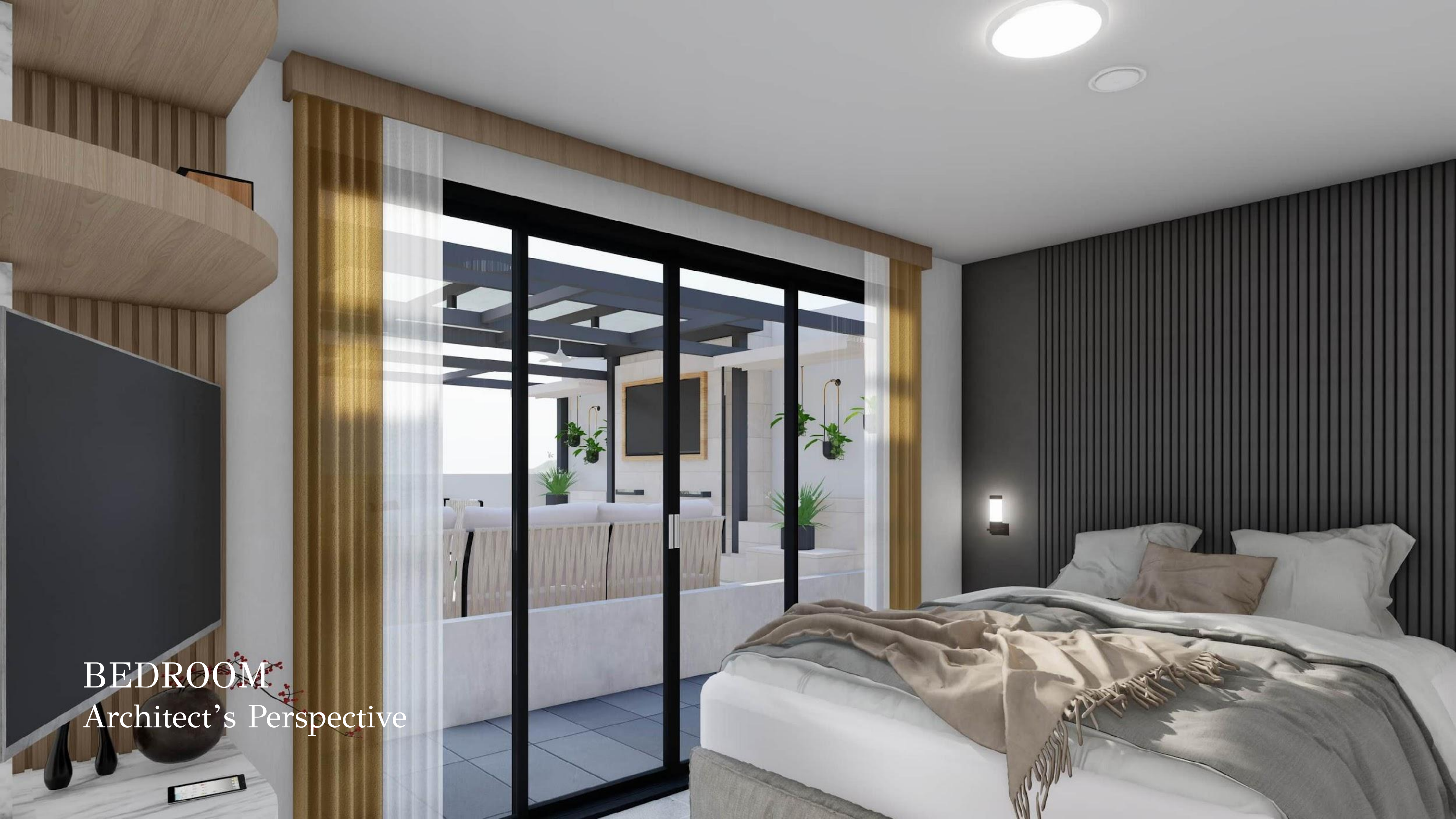
BEDROOM Architect's Perspective