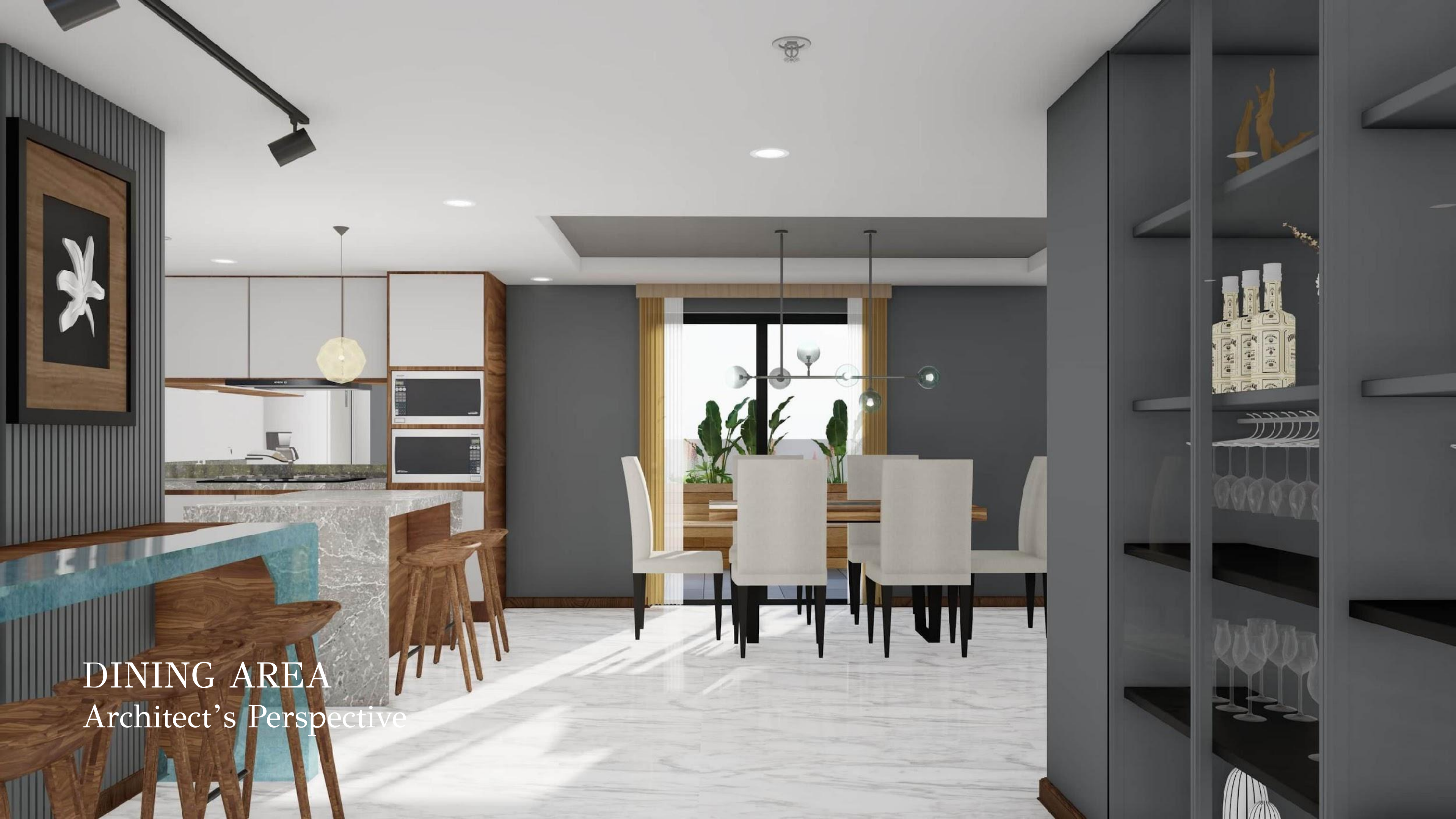
DINING AREA Architect's Perspective