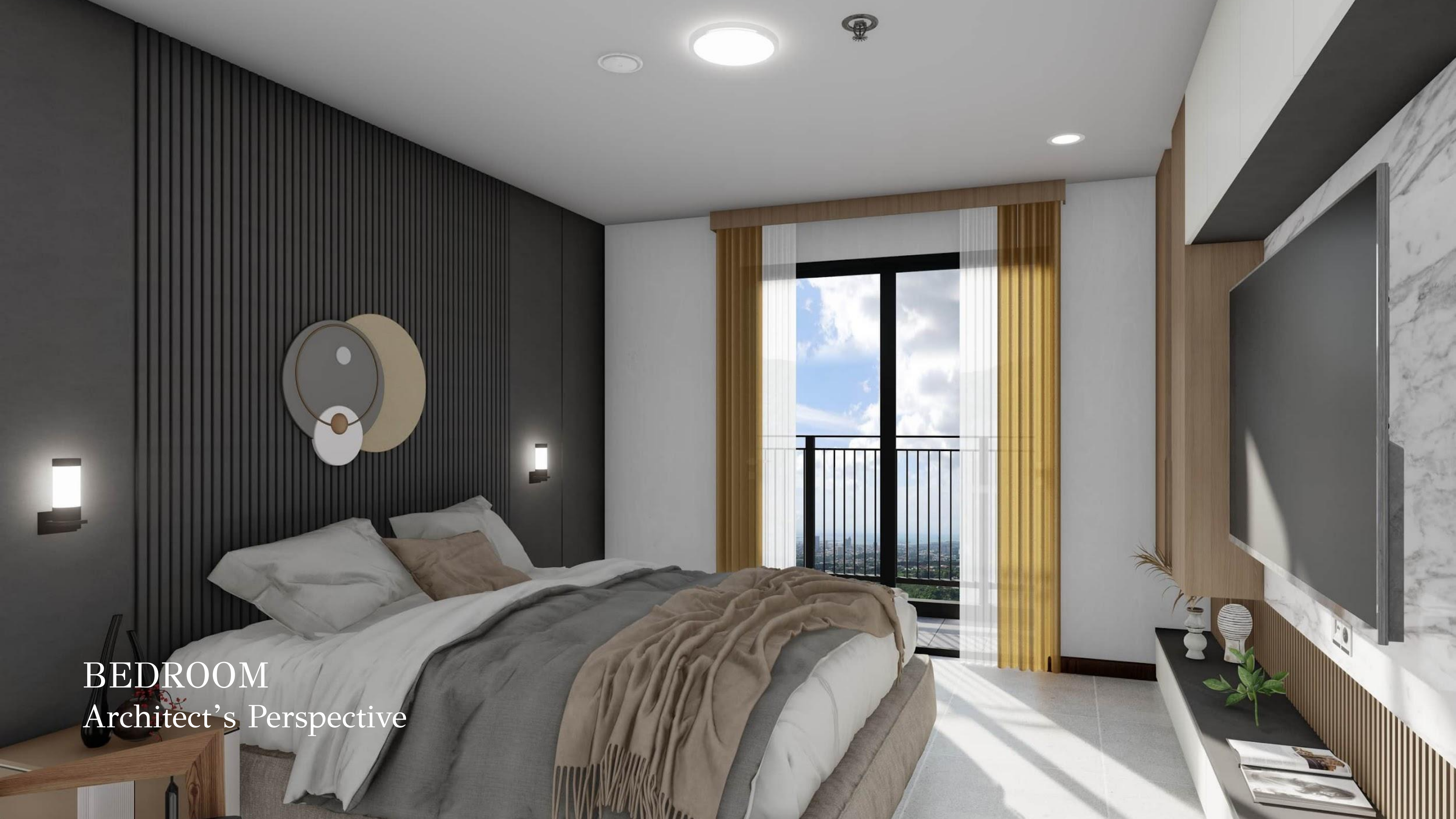
BEDROOM Architect's Perspective