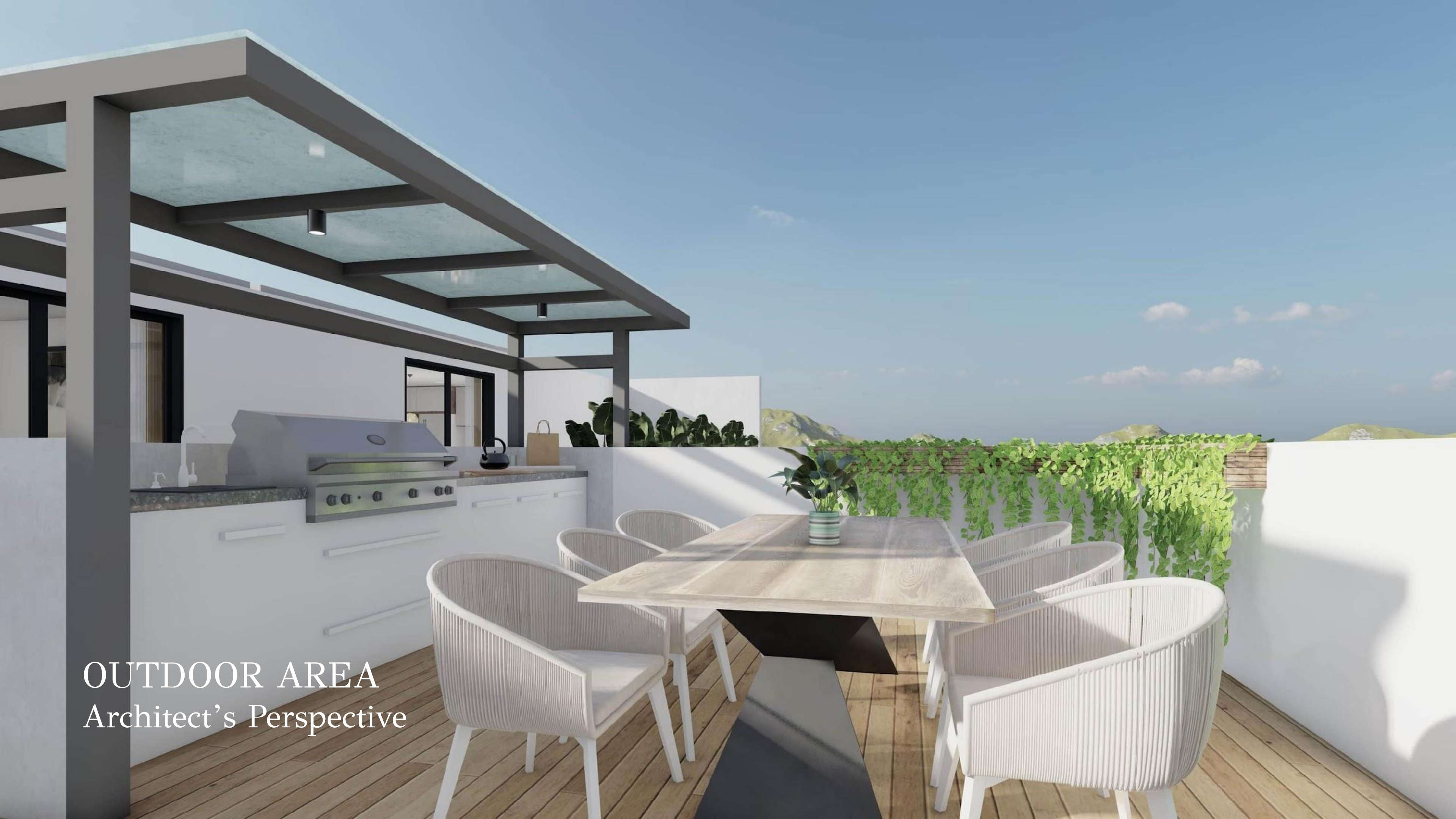
OUTDOOR AREA Architect's Perspective