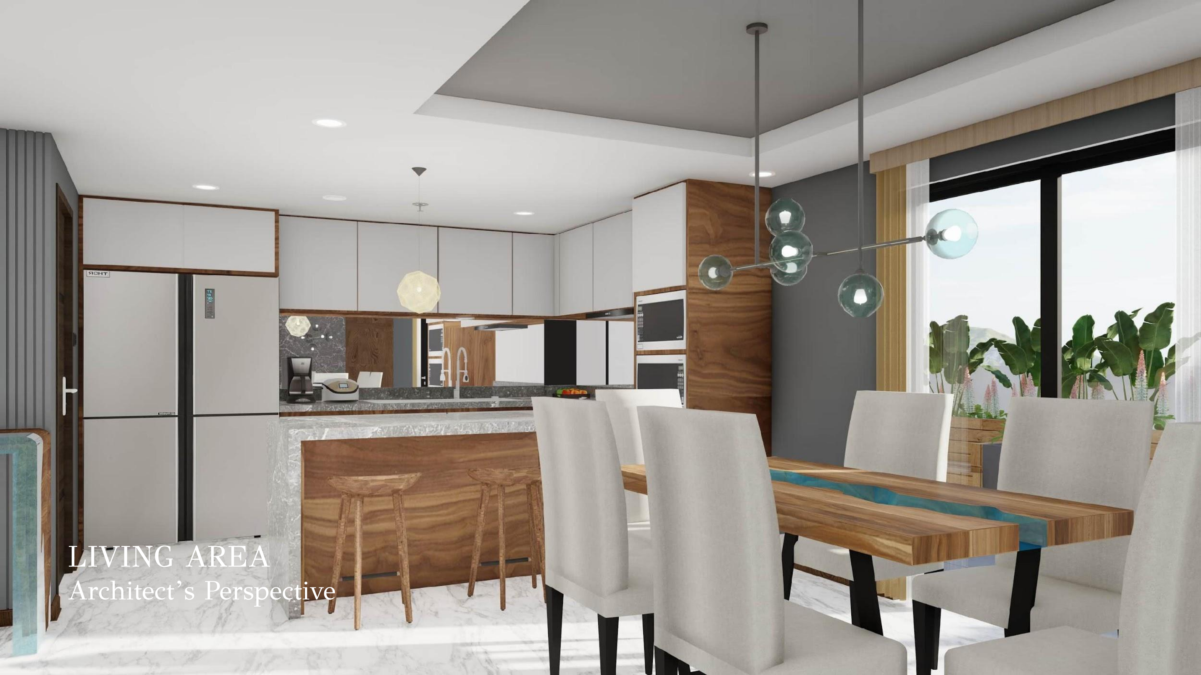
LIVING AREA Architect's Perspective