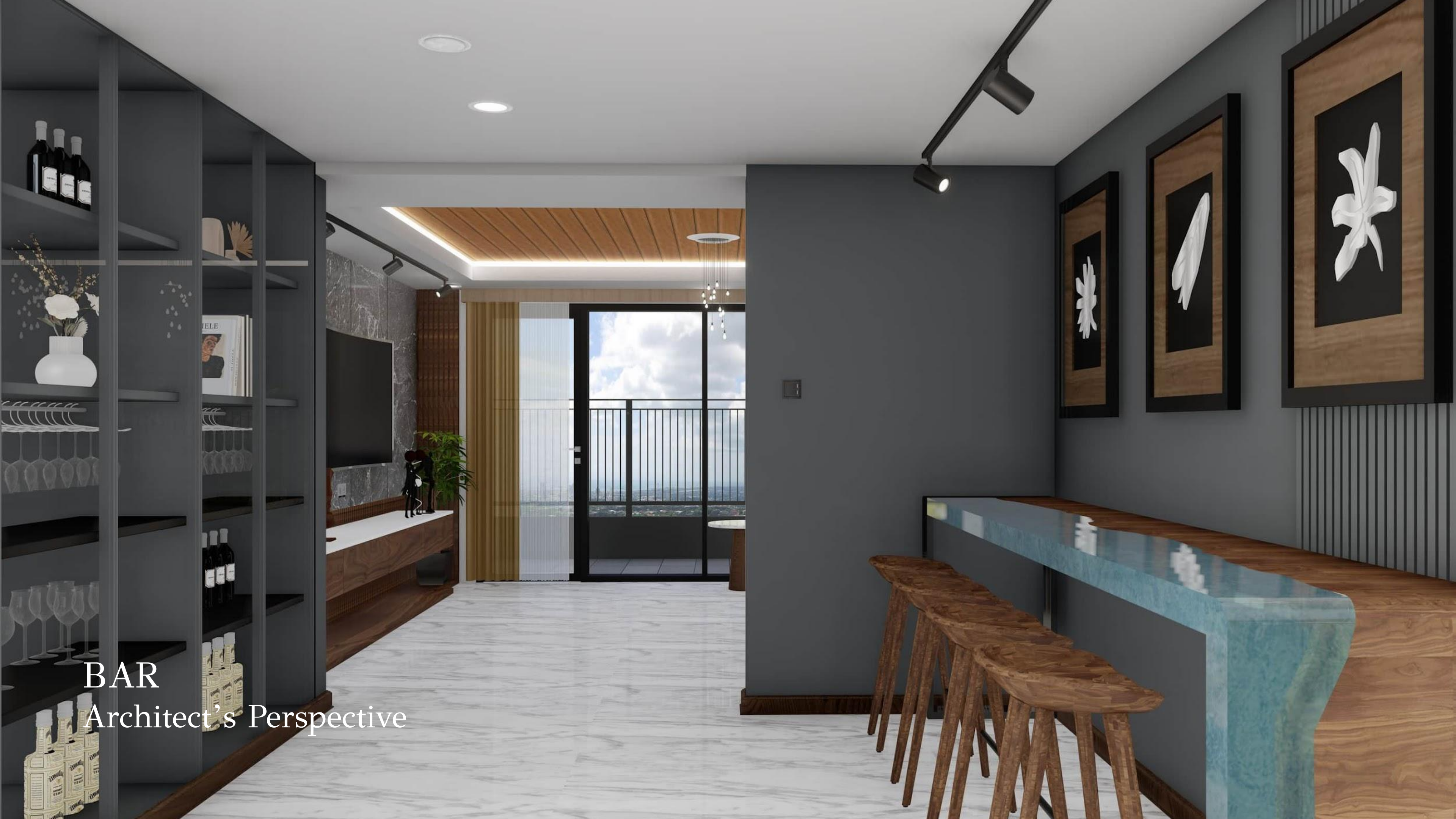
BAR Architect's Perspective