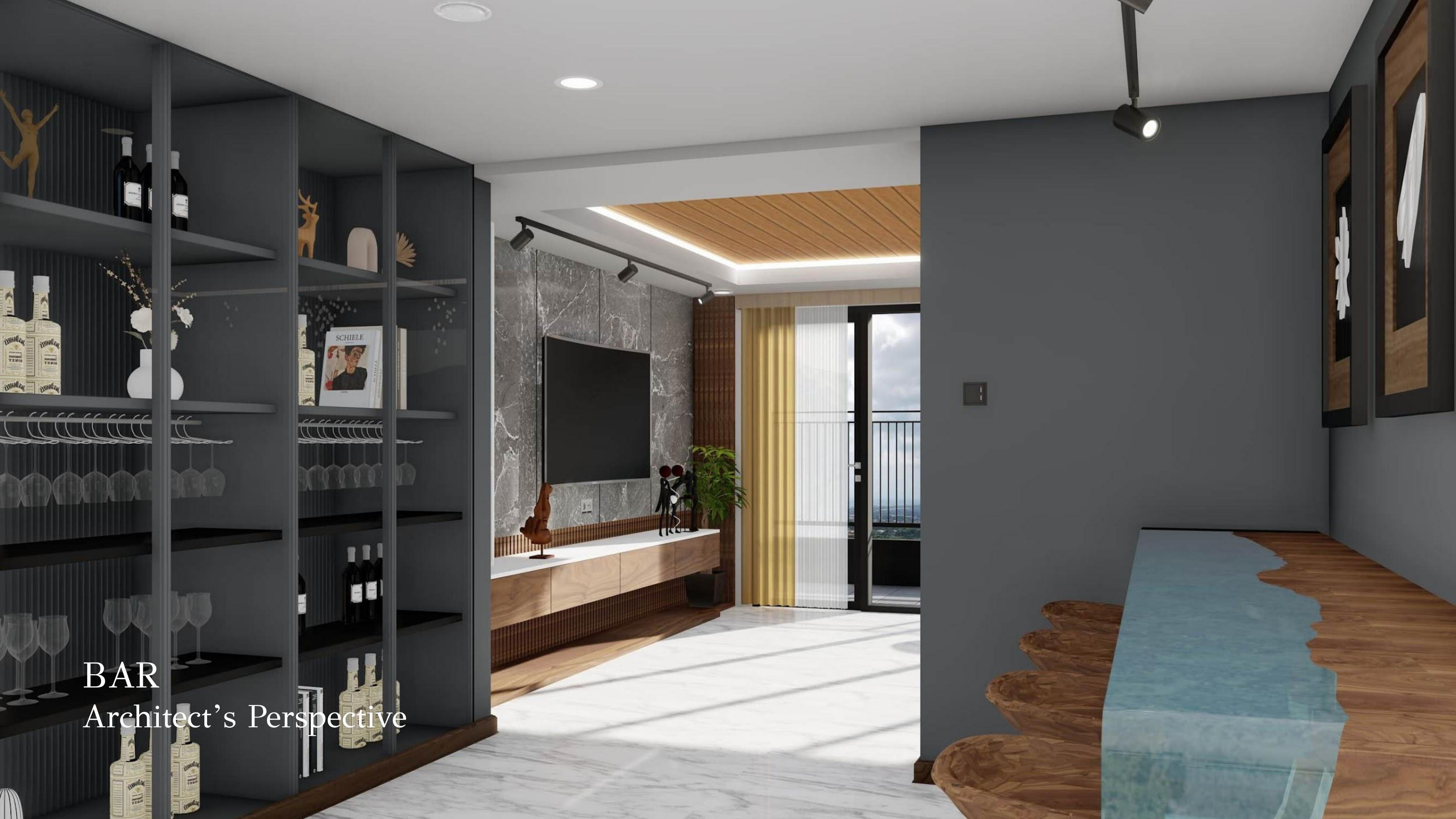
BAR Architect's Perspective