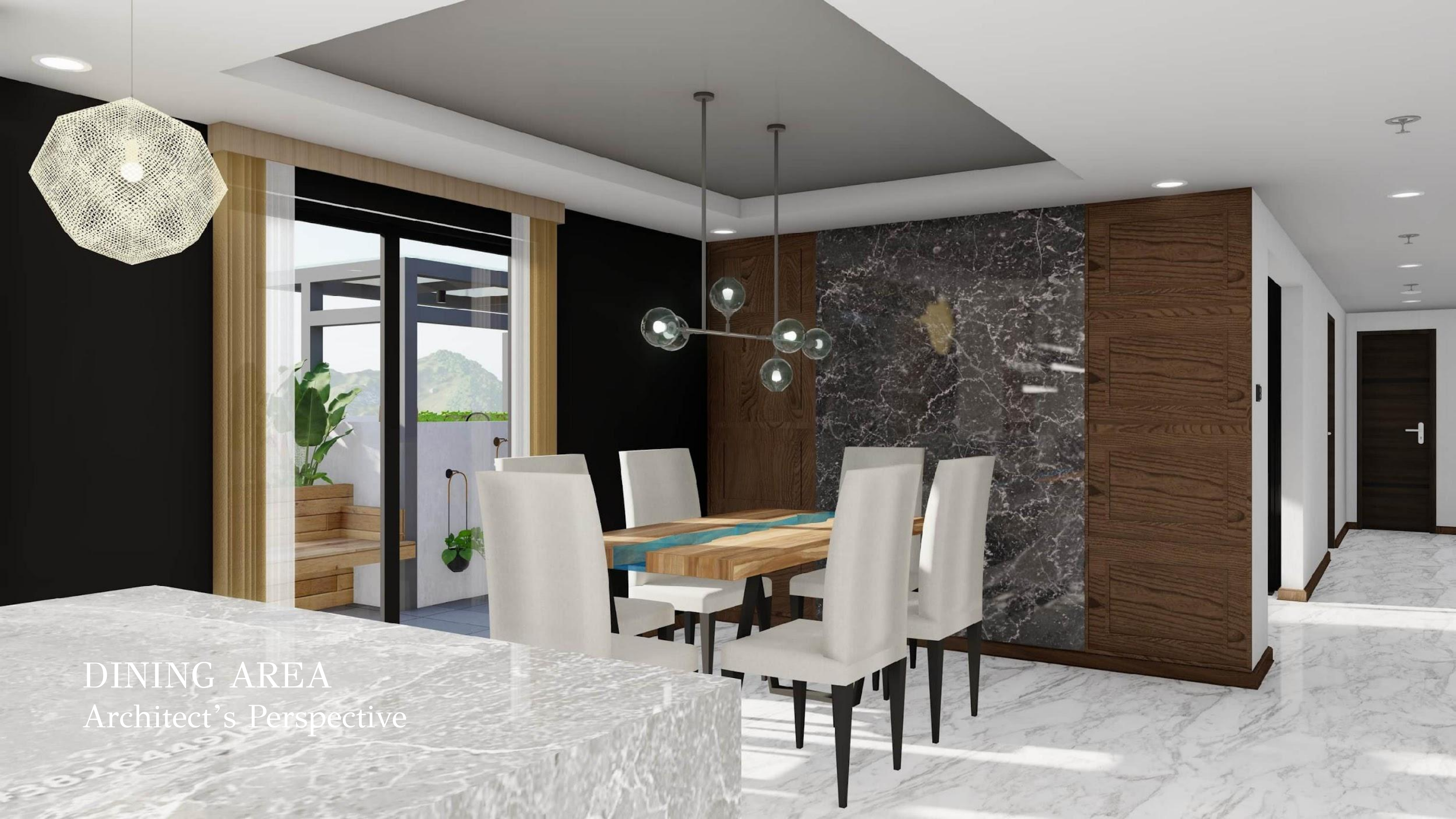
DINING AREA Architect's Perspective