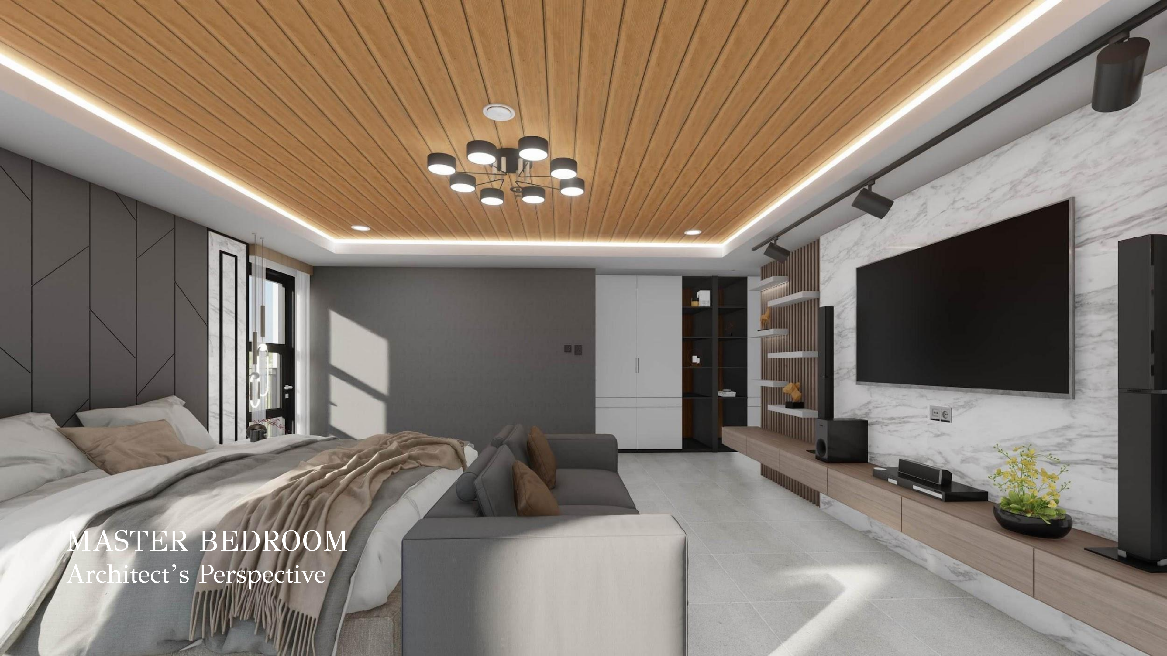
MASTER BEDROOM Architect's Perspective